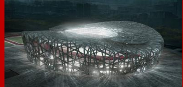
Bird Nest Beijing 2008

Discover China's political capital with a heritage rich in culture and history. Be sure to visit the Great Wall, the Olympic Park in the northern suburbs of the city and see the Bird's Nest, Water Cube and Olympic Village with your own eyes.